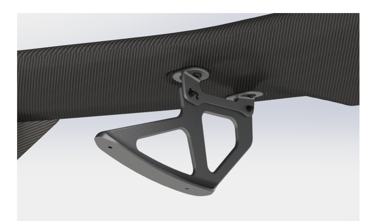
Fig 2: Mounted JUBU rear wing brackets to the wing

3. Mount the wing-blade back to the car using 4x M5x18 lenshead screws (3) together with M5 K-nuts (10), fix them with screw lock LOCTITE 243 and tighten them with 6Nm.