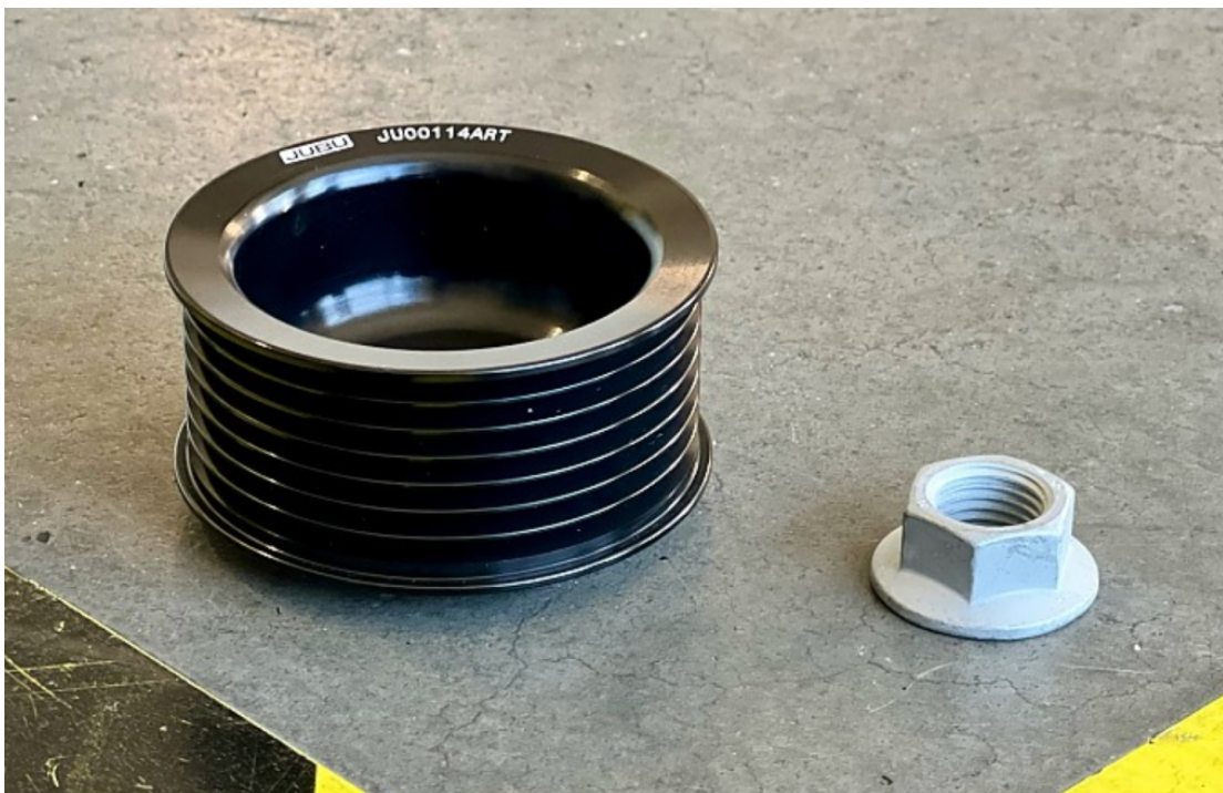
Fig 1: Scope of delivery