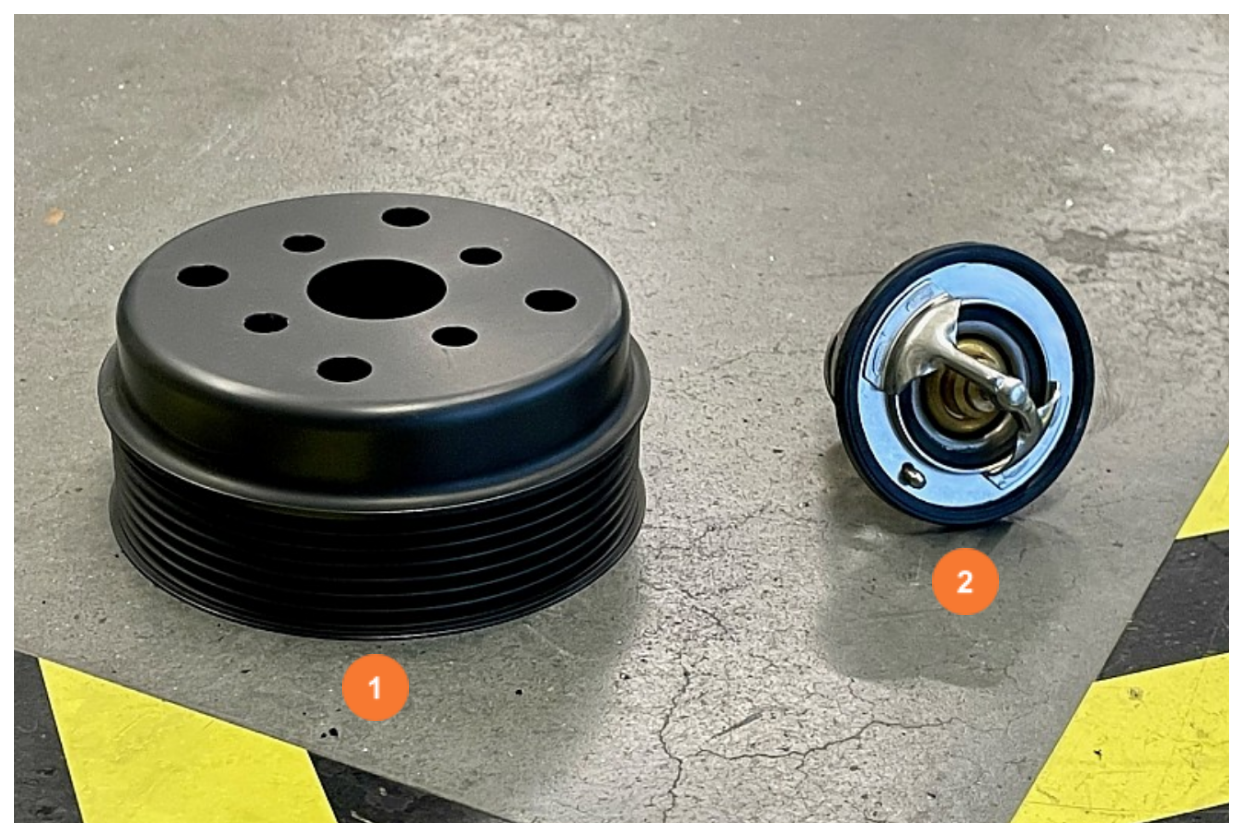
Fig 1: Scope of delivery