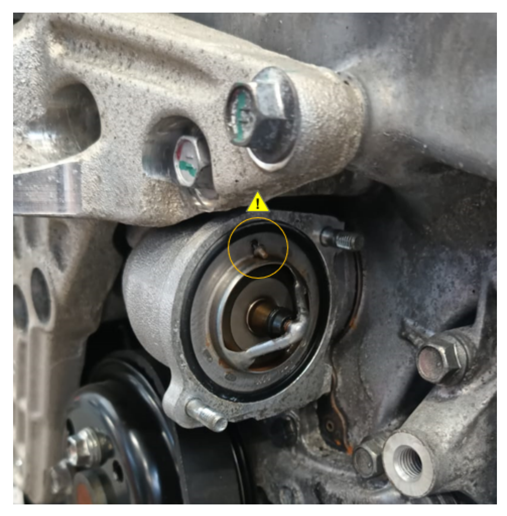
Fig 3: Replacing the thermostat.