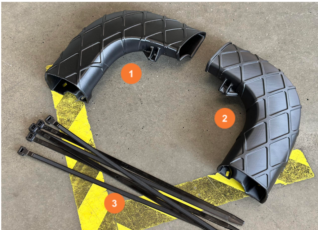
Fig 1: Scope of delivery