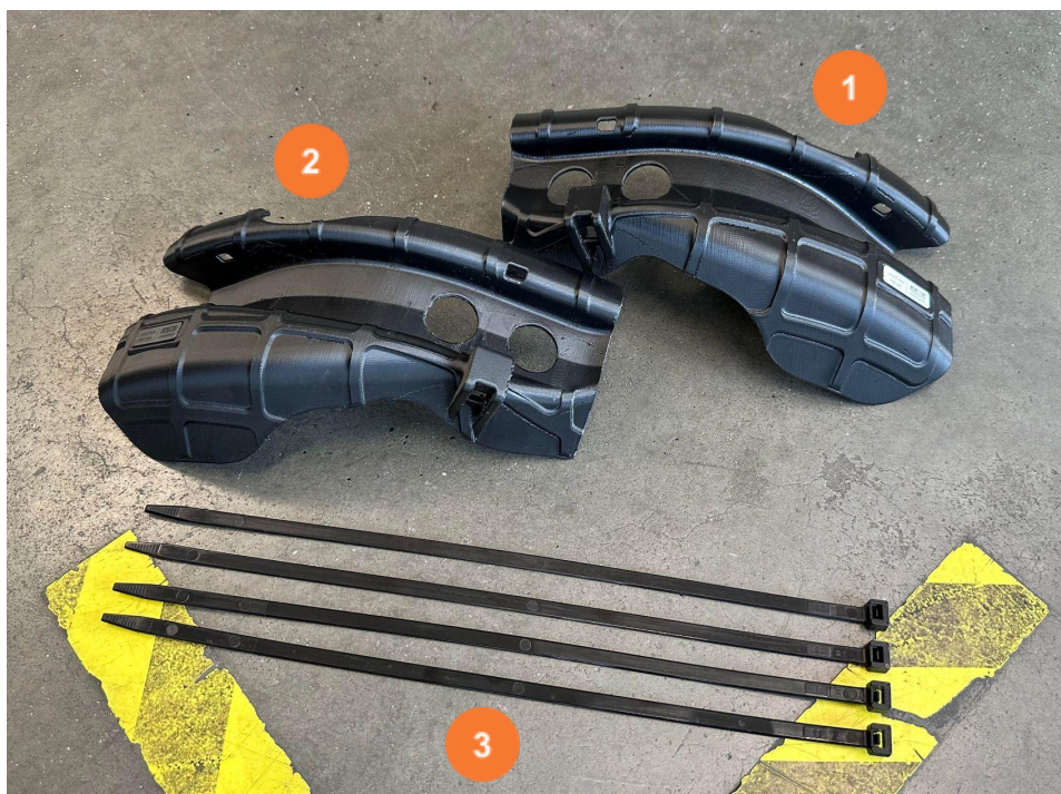
Fig 1: Scope of delivery