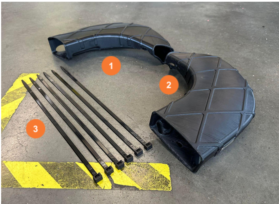
Fig 1: Scope of delivery