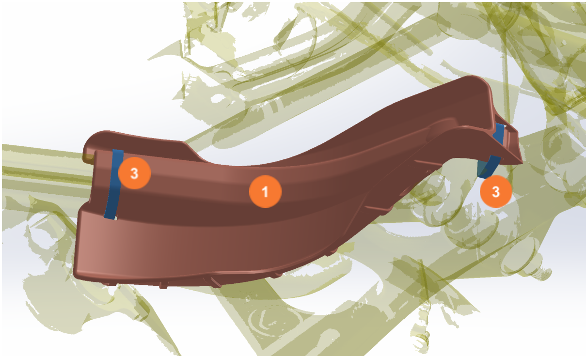
Fig. 2: Correct assembly and placement of the Cable ties (front left) (I)

⚠ NOTE: Don't over tighten the cable ties.