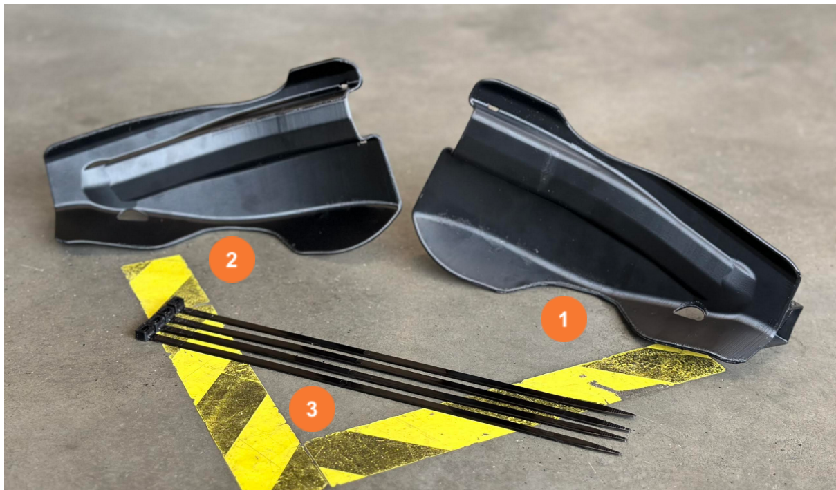
Fig 1: Scope of delivery