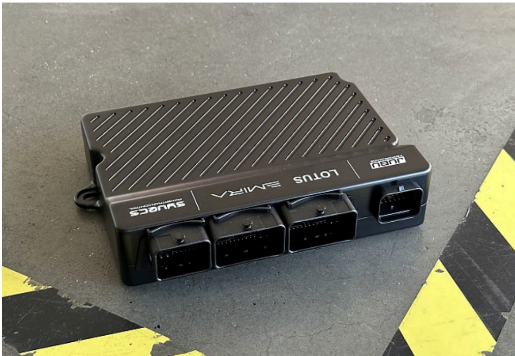
Fig 1: Scope of delivery