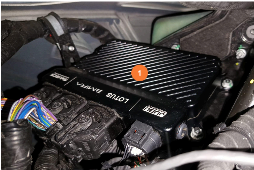
Fig 2: Installing the JUBU Plug & Play ECU Kit (1)