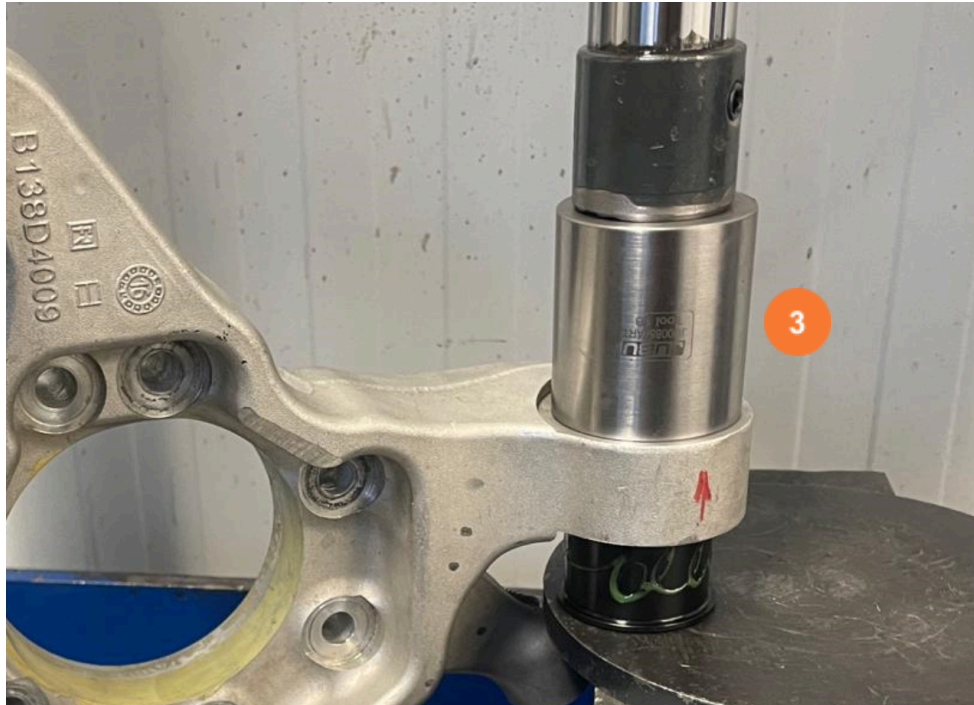
Fig 5: Press in the unibal bushings (1)