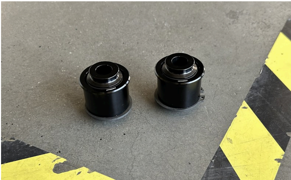
Fig 1: Scope of delivery