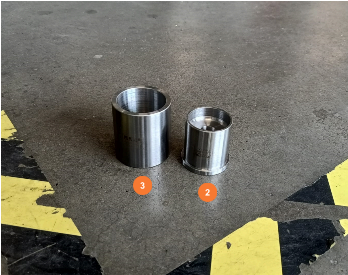
Fig 2: Scope of delivery tool set (optional item)