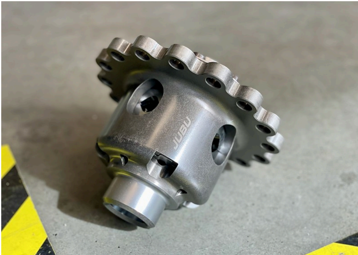
Fig 1: Scope of delivery