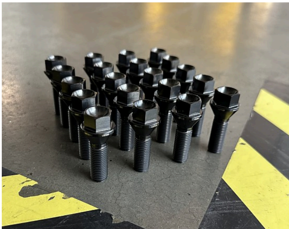
Fig 1: Scope of delivery