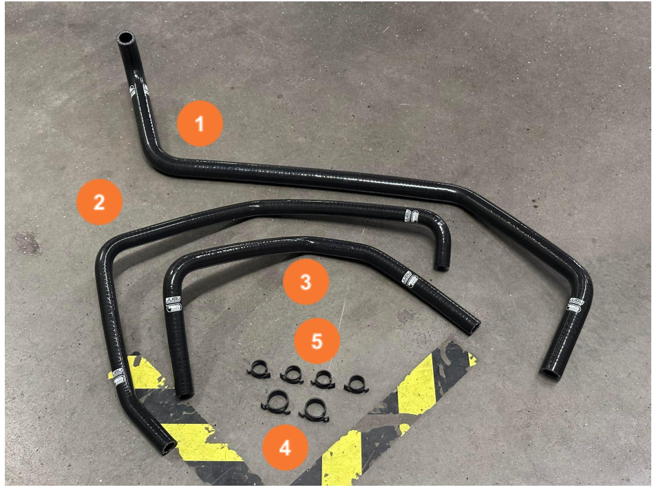
Fig 1: Scope of delivery